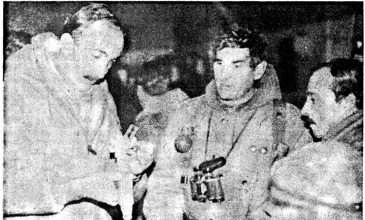
COL. MOHAMED ALI SEINELDIN (center), leader of the Argentine military action, shown here examining captured British war materiel during the Malvinas War of 1982.

Seineldin's resistance has great strategic significance for its potential. Please turn to page 9, col. 1