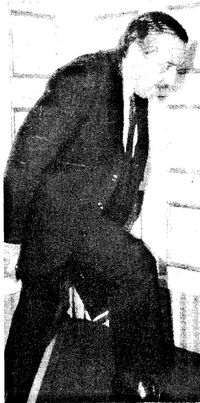
Argentina's unpopular President Alfonsin